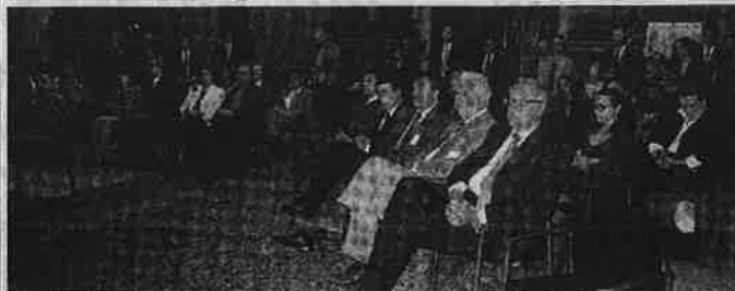
MASSIVE turnout of Italians and Italian Americans active in public life in greater Delaware Valley area came to enjoy kickoff in City Hall's Conversation Hall of "Ciao Phila.," a month-long program featuring close and valuable connections between Italy and Phila. area.